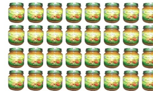
Baby Food - fruit/vegetable puree 32 (4oz) Jars